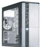
Tool-less Drive System