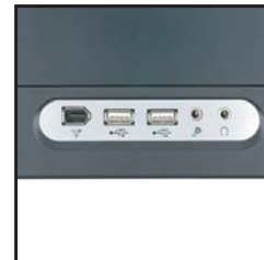
Top Access USB, Firewire, & Audio