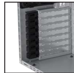
Tool-less PCI Slots