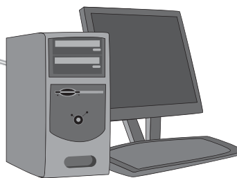
Computer USB Port