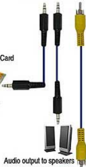
Audio output to speakers